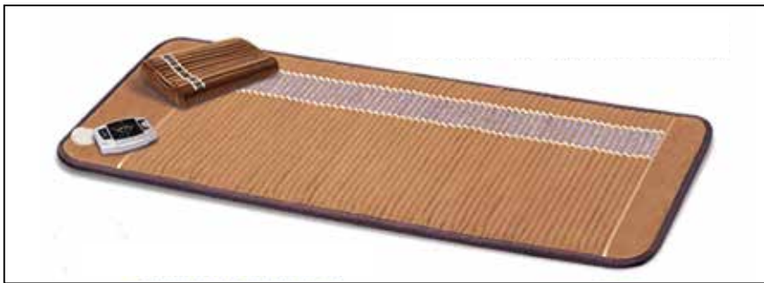
Figure 2 The amethyst BioMat and the Time/Temp control